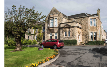
Abbotsford Care Home, Ardrossan - 39 residents

Following a recommendation by the North Ayrshire Health and Social Care Partnership under the Integrated Care Fund, Ideas and Innovations scheme the Abbotsford Care Home set up an Enhanced End of Life Care Service. The funding for one bed was provided for a year to enable local residents with end of life care needs the opportunity to be cared for as close to home as possible, when remaining in their own home was no longer a viable option. The management team recognised the importance of ensuring their staff felt prepared and equipped to support this service and approached Macmillan Cancer Support, the Ayrshire Hospice and NHS Ayrshire and Arran to plan, develop and deliver a robust bespoke training programme to support this new and innovative service.